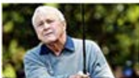
Arnold Palmer, the King of Golf

Welcome to our September newsletter, as we hope this keeps you updated on our latest news and provides you with useful information about our Section. We hope you all enjoyed the beautiful Summer months this year and great golf season weather, as the Ryder Cup Week is finally here!